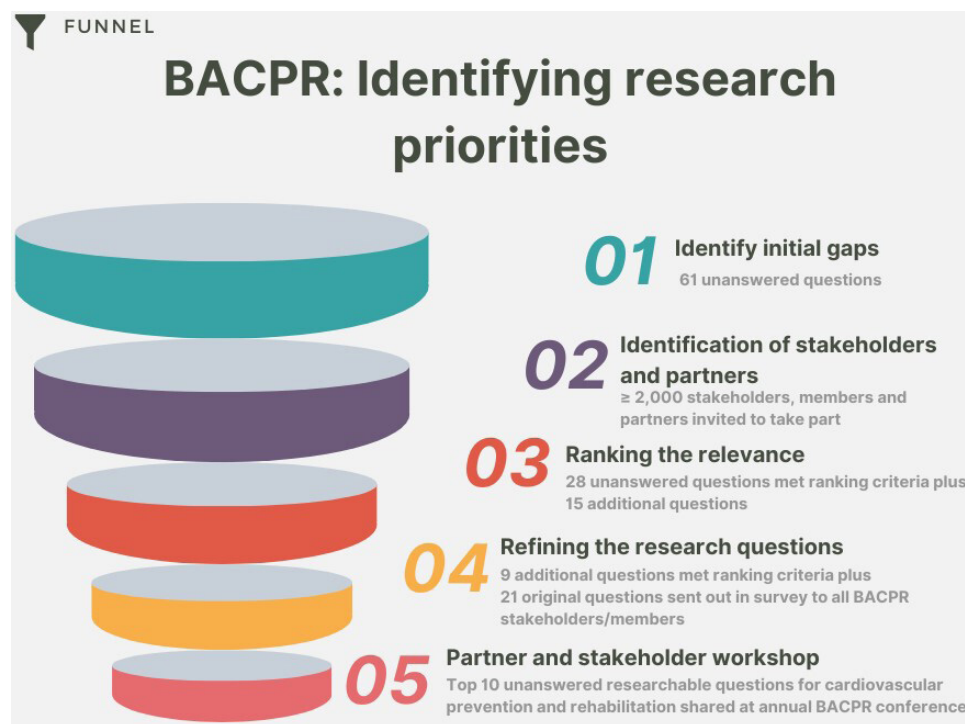
Figure 1 Summary of the findings from the five-step process. BACPR, British Association for Cardiovascular Prevention and Rehabilitation.

After refinement of these questions, a total of 30 questions (online supplemental appendix 2) were carried